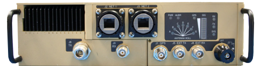
FRONT PANEL CLOSE UP